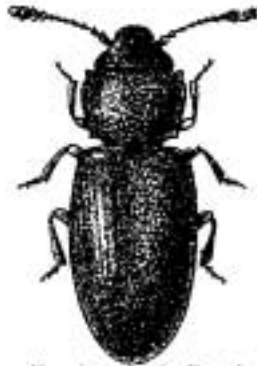
Foreign Grain Beetle

We do not suggest insecticides for control. Although flying insect sprays will kill the adults, more will migrate indoors within 24 hours. Running dehumidifiers or checking vents for proper screening will help reduce migration.